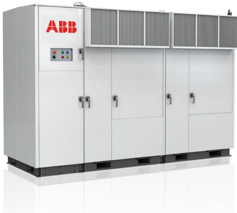
ABB central inverters raise reliability, efficiency and ease of installation to new levels. The inverters are aimed at system integrators and end users who require high-performance solar inverters for large photovoltaic (PV) power plants. PVS980 central inverters are available from 1818 kVA up to 2000 kVA, and are optimized for cost-effective, multi-megawatt power plants.