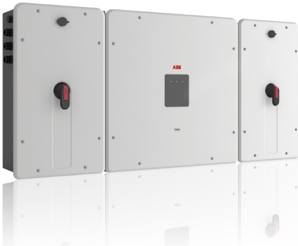
ABB string inverters TRIO-50.0-TL-OUTD 50kW

The most powerful ABB string inverter available today, the TRIO-50.0 has been designed to maximize the ROI in large systems. It has all the advantages of a decentralized configuration for both rooftop and ground-mounted installations.