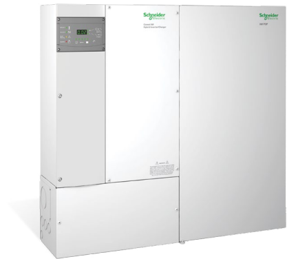
Products shown: Schneider Electric Conext XW inverter/charger, XW Power Distribution Panel and XW Conduit Box